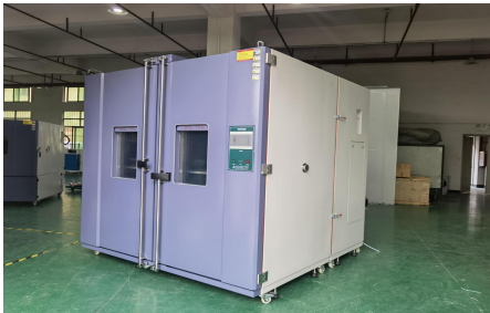
3.6 m3 constant temperature and humidity laboratory