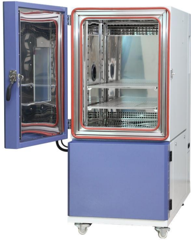
150L Vertical high and low temperature test chamber