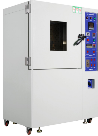
Ventilation type aging test chamber