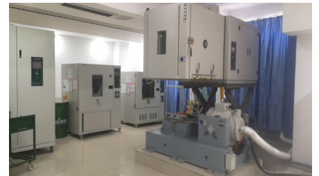
Three comprehensive test chamber