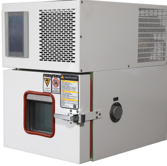
225L High and Low Temperature Humidity and Heat Alternating Test Chamber