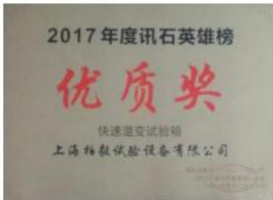
Hot & Cold test chamber

- 2017 Annual News Stone Hero List Quality Award