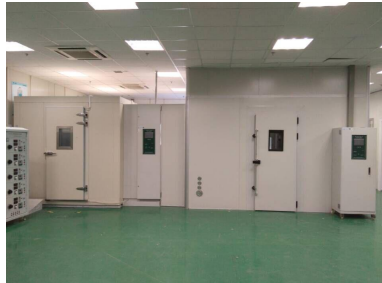
9 cubic meters low temperature room, 13 cubic meters high temperature room