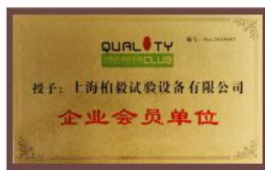
China quality club enterprise member

Shanghai BOYI & Beijing Jiaotong University