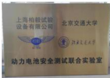
Joint Laboratory of Power Battery Safety Testing

Shanghai BOYI & Beijing Jiaotong University