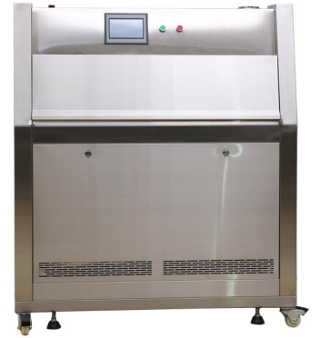
Leaning tower ultraviolet aging test chamber